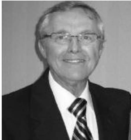
Curt Hutchens, President-Elect

AARP and NRTA can and will play a role in educating our members on this important issue. AARP has in the past taken a stand on issues like privatization of individual Social Security, Prescription Drugs being covered by Medicare and eliminating the prescription drug donut hole coverage.